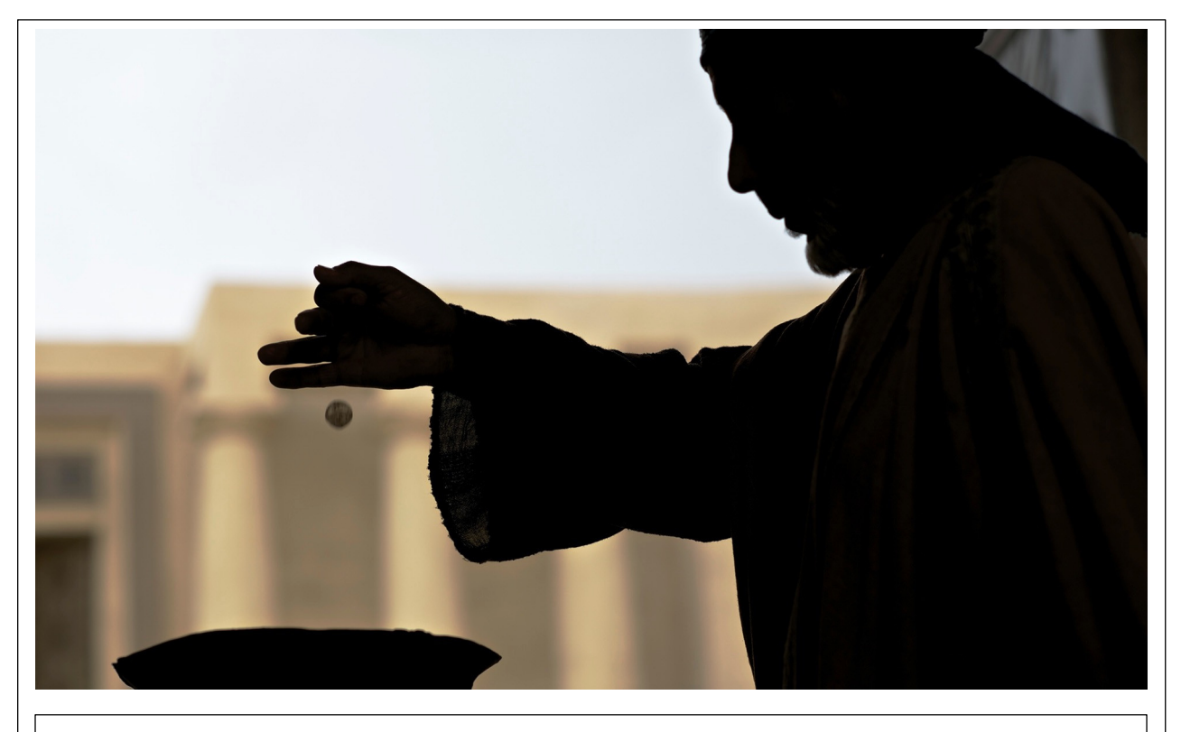
Mark 12:38-44 – The Scribes and the Widow